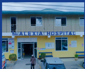
2021: Upgraded to a district level hospital