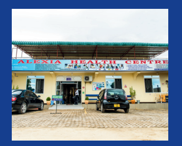
2016: Became a health center