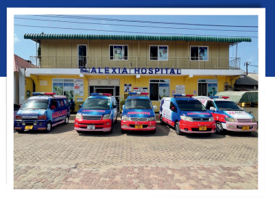
EMERGENCY CARE & MEDICAL TRANSPORT