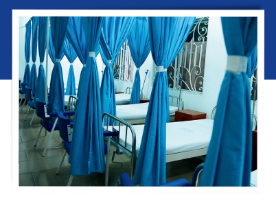
OUTPATIENT & INPATIENT